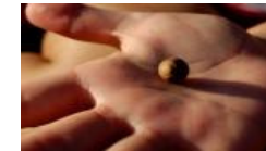
From the small seed of our gifts the true vine can grow

stickers—a practice you are all invited to continue in the next few days.