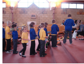
The children love being part of the parish

the school. Number are being maintained and where there has been movement it has been for other normal reasons such as moving homes. The Head and 6 teachers will be attending a theological